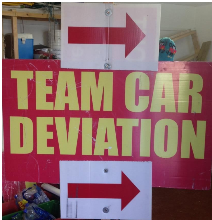
Team car deviation sign with arrows