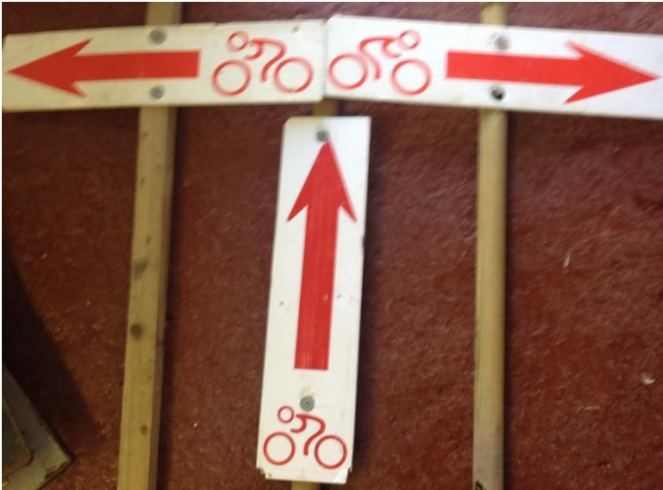
Roadside direction arrows