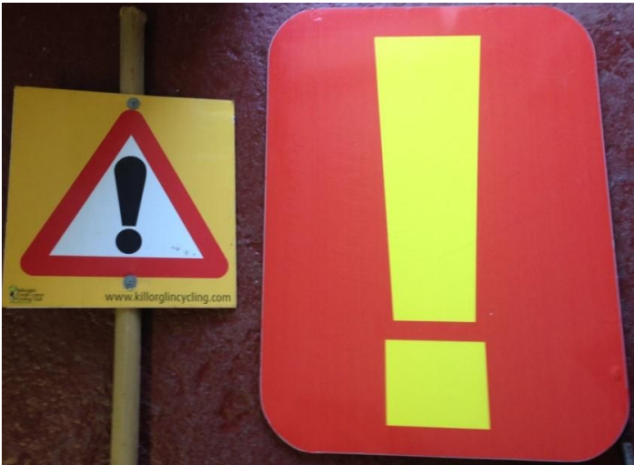
Danger ahead warning signs