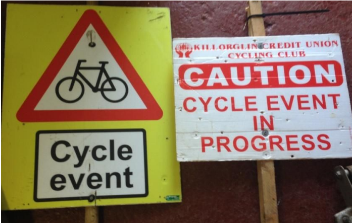
Road traffic information notices